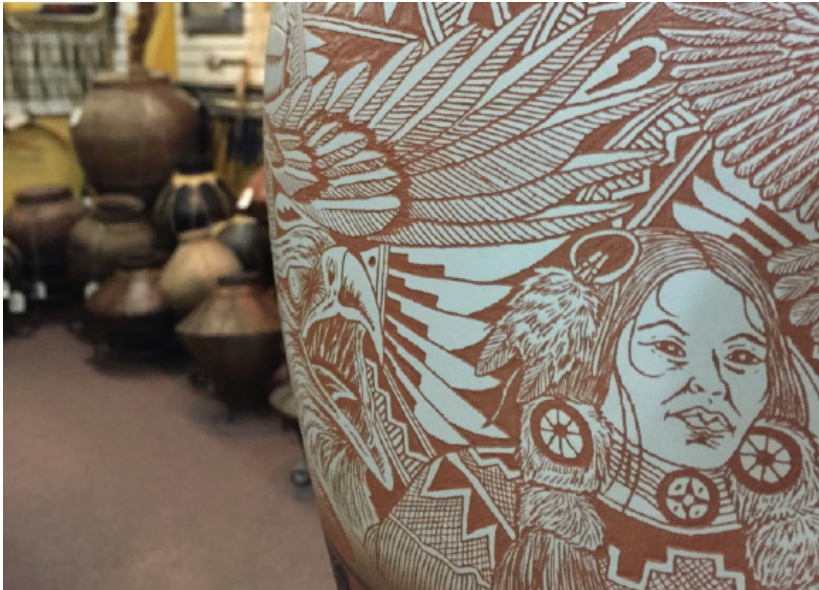
Mac-A-Bee Southwestern Gifts

Home décor, fashion accessories and high-end gifts for young and old, just steps away from the Fireside Lounge.