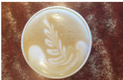
Pioneer Coffee Roasting Co.

Here in Cle Elum, we value well-prepared dishes and craft beverages. Downtown Cle Elum offers a variety of restaurants, specialty food shops, coffee bars, and late night pubs within a mile radius. Many food options in Cle Elum are sourced from local ranchers and artisan bakers; with dishes available for every type of eater. For a night on the town, discover the pubs' rotating beer taps and tasty happy hour specials.