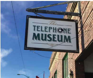
Pacific Telephone and Telegraph Co.

The oldest complete telephone museum west of the Mississippi, including mining artifacts and bank memorabilia.