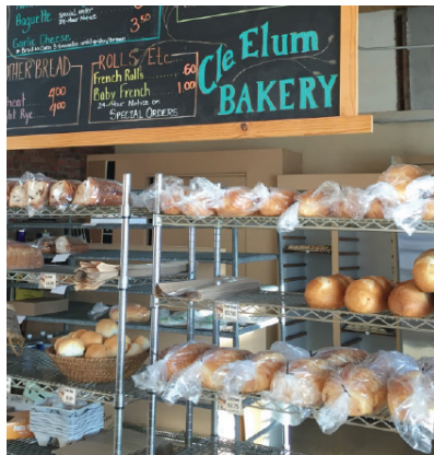
Cle Elum Bakery

Rustic décor and a "getaway" ambiance, serving wraps, soups, salads, and specialty dishes.