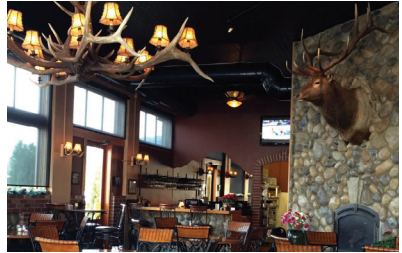
Beau's Pizza and Pasta

Gourmet pizza, pasta, and steak dishes served in an upscale lodge atmosphere.