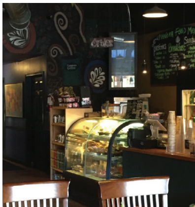
Pioneer Coffee Roasting Co.

Signature bagna-cauda appetizer, specialty steak, and pasta dishes in a cozy atmosphere.