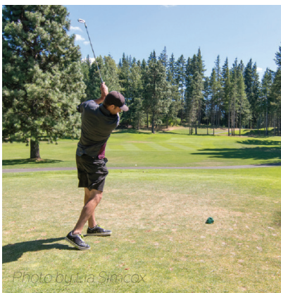
Sun Country Golf Course