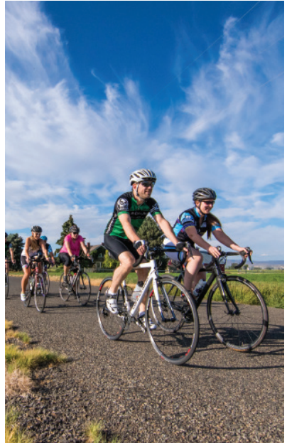
Bicyclists in Kittitas County