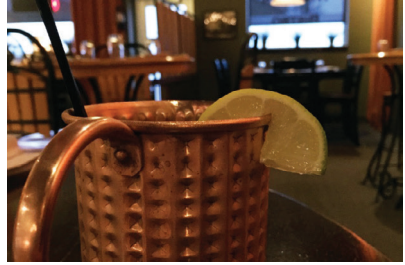
Parlour Car Wine Bar and Bistro

Traditional pizza options, cheesy bread and beverages to enjoy or take home!