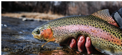
Troutwater Guided Fly Fishing

Travel off the pavement to a hiking trail for some fresh air and breathtaking scenery, stop by some of our wonderful museums, or visit one of our quirky local attraction on your Cle Elum excursion. Cle Elum is your playground in the mountains.