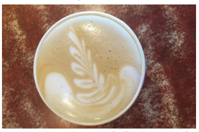
Pioneer Coffee Roasting Co

Here in Cle Elum, we value well-prepared dishes and craft beverages. Downtown Cle Elum offers a variety of restaurants, specialty food shops, coffee bars, and late night pubs within a mile radius. Many food options in Cle Elum are sourced from local ranchers and artisan bakers; with dishes available for every type of eater. For a night on the town, discover the pubs' rotating beer taps and tasty happy hour specials.