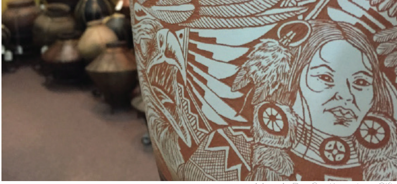
Mac-A-Bee Southwestern Gifts

Thousands of antique and vintage items line the packed shelves and floor spaces of this unique shop.