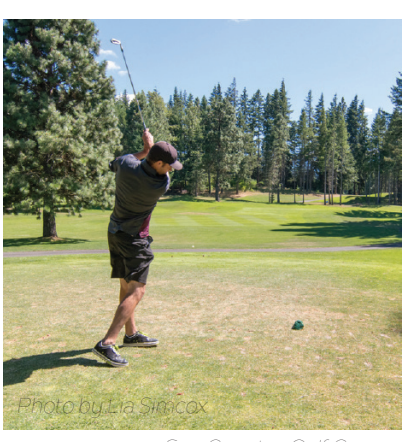
Sun Country Golf Course