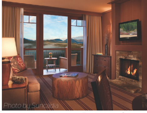
The Lodge at Suncadia

After a weekend of hiking, biking, snowmobiling and visiting with friends, Cle Elum's downtown lodging facilities will feel like coming home. Classy comfort, a little bit of quirky relaxation, and a lot of good hospitality awaits every special visitor in this beautiful town. Cle Elum has what every traveler needs at the end of an adventure filled dau.