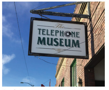
Pacific Telelphone and Telegraph Co.

nkcmuseums.wordpress.com/telephone-museum/